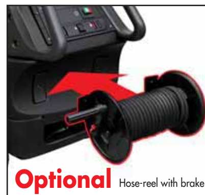
Optional Hose-reel with brake